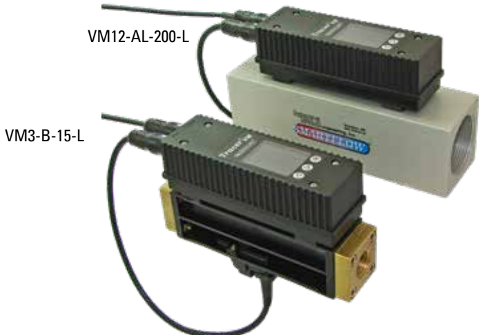
Local User Interface

How to order Two part numbers are required to order. 1 - Choose the model number from this page 2 - Choose cable per below EFM-CBL-OPCA - Loose leads (standard, ends stripped) CBL-VMI-WWA - 120VAC power supply wall adapter EFM-CBL-OPC-O - Cylindrical connectors for use with RJG IA1 module