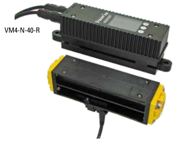
Remote User Interface