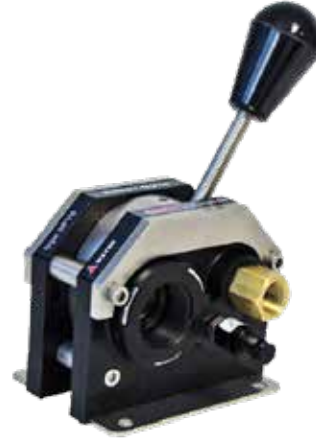
Model # Options with Check Valve