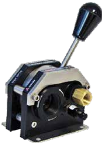
Reinforced Molded Body with Stainless Disc Available in 1" Reinforced Molded Body with Stainless Steel Disc or Brass (via special order,) U.S. Patent No. 6,471,503