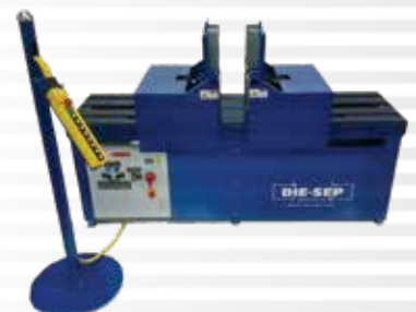
Dual Tilting Platens