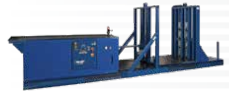
* See back page for additional options.