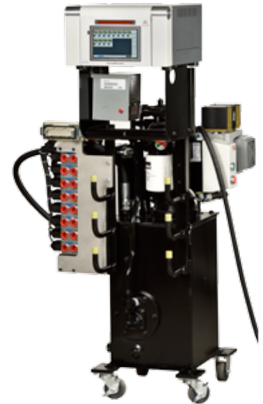
3L-1200 PSI / 3L-1600 PSI Power pack