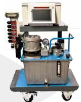
3L-600 PSI Power pack