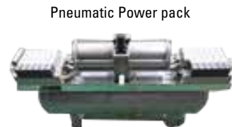
Pneumatic Power pack