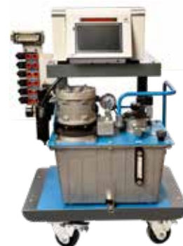
3L-600 PSI Power pack

If you do not see the number of controlled zones required in the table above please contact us.