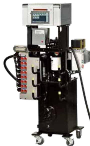
3L-1200 PSI / 3L-1600 PSI Power pack