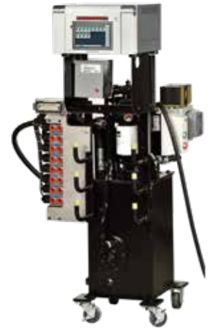
3L-1200 PSI / 3L-1600 PSI Power pack