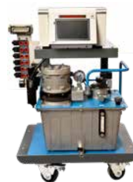
3L-600 PSI Power pack