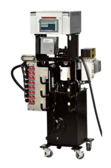
3L-1200 PSI / 3L-1600 PSI Power pack