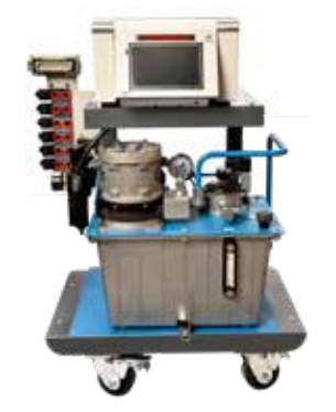
3L-600 PSI Power pack