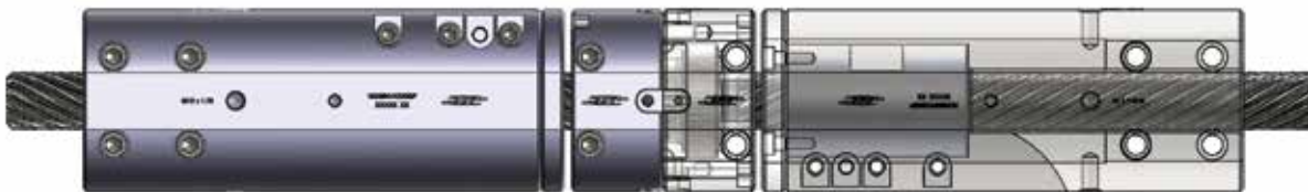
HELICAL GEAR CENTERING DEVICE – complete assembly