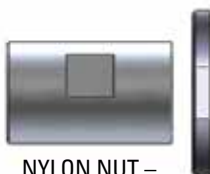
NYLON NUT – available in left- or right-hand threads