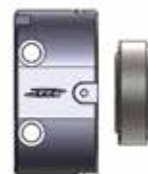
ROLLER BEARING HOUSING