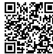
Find the FF7PLUS in the DME estore