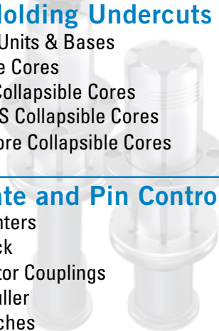
Plate and Pin Control