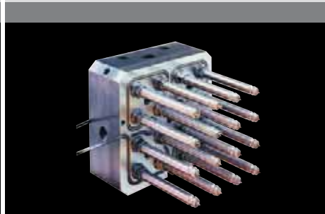
Stellar multi-nozzle assemblies provide application flexibility