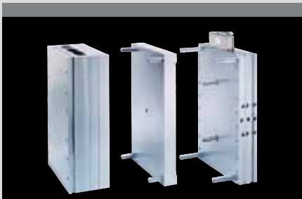
Meteor Systems are custom configured for quick delivery

D-M-E provides essential support to keep your hot runner systems in-service. Our dedicated hot runner service center is staffed by trained, experienced technicians who support D-M-E systems, as well as other brands, to provide help when and where you need it, every step of the way.