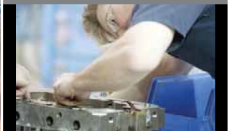
D-M-E Hot Runner Service Center provides total support for your hot runner system