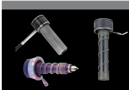
A wide range of D-M-E nozzles allows versatility in system selection