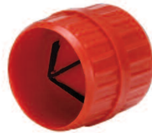
PLUM-BURR PLASTIC SHOWN